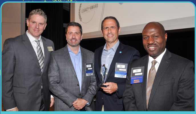
In 2019, FFB was given the "Legacy Award" from the BBB for being accredited for over 50 years.