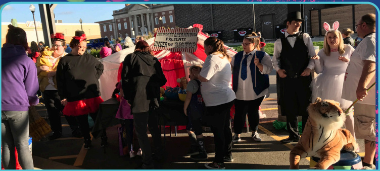
Our Deposit Operations Team being "in tents" and passing out candy at our 2nd annual Trunk-or-Treat!