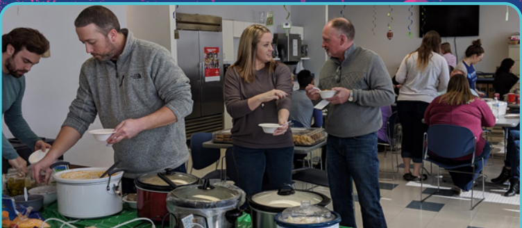
Our annual "Souper Bowl" lunch at our administrative center in support of our partnership with Harvesters

We aren't "party animals," but we do have fun while making a positive impact around Kansas City.