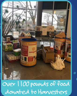
Over 1100 pounds of food donated to Harvesters