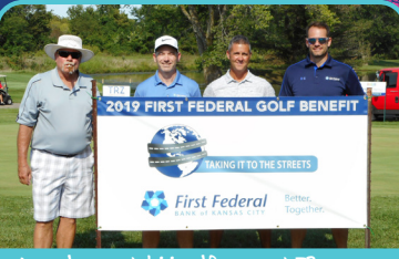
We welcomed 144 golfers and 72 sponsors to our 3rd annual golf benefit