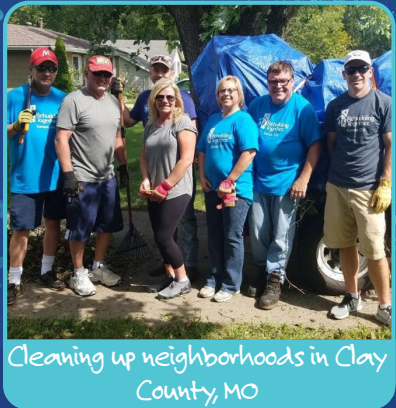
Cleaning up neighborhoods in Clay County, MO

Total Volunteer Hours 479 Total Corporate & Employee Donations $90,000