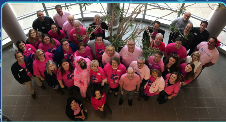
Making Strides Against Breast Cancer: $10,912.67 employee donations