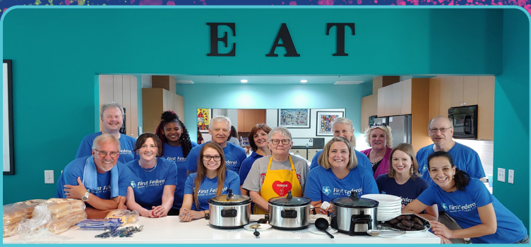
Whippin' up some tasty grub at Ronald McDonald House!