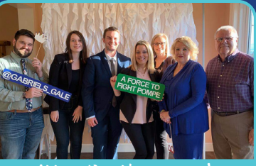
Attending the annual Gabriel's Gale charity dinner